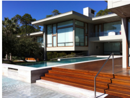
Hilton Head Beach House

Hilton Head Beach House - Hilton Head Island, SC Innovative, modern 10,000 sf coastal home with CLT wood decking system. At the time of construction this was the first residential project on the east coast utilizing new product material, CLT; considered to be one of the first CLT projects in the US.