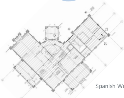
Spanish Wells Residence

New, contemporary house on Hilton Head Island, SC. A number of unique conditions and spans that make this house interesting, requiring detailing and design structurally. This includes steel frames for gravity and lateral requirements. First floor - dimensional lumber, second floor - 14" deep floor TJI's. The house is elevated to meet flood requirements, and the first level constructed on 8" CMU walls. The interior supports are 16" CMU piers with (4) #5 vertical bars and ties at 8" on center. The piers bear on a continuous 16" deep x 24" wide grade beam with (2) #5 bars top and bottom. The roof is framed with engineered roof trusses at 2'-0" on center.