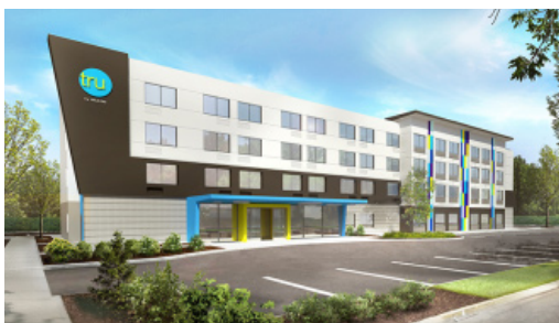
TRU by Hilton

Provided special inspections and construction support for a multi-office medical facility serving growing demand in larger Bluffton region.