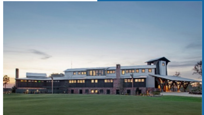
Ohoppee Match Club

Completed in 2018, multi-building golf complex featured a two-story, exposed, heavy wood-framed clubhouse with steel aspects. Close collaboration with architect, Thomas & Denzinger, was a key part of the structural design; working to accomplish aesthetic goals of the visible connections as well as the structural function.