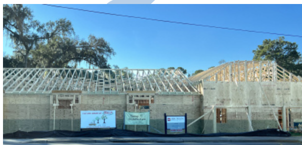
Help of Beaufort